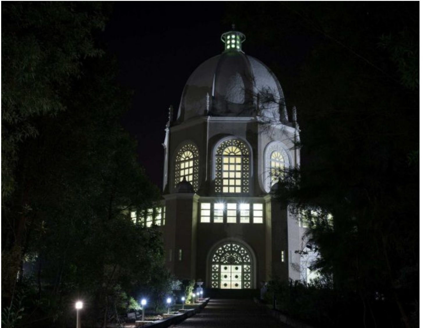
IMAGE: BAHAI HOUSE OF WORSHIP IN SYDNEY BY NIGHT