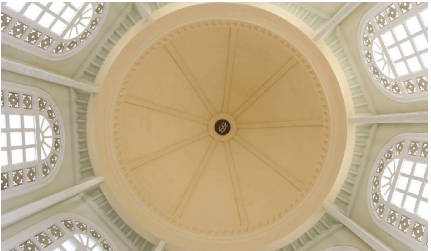
IMAGE: BAHAI HOUSE OF WORSHIP IN SYDNEY UNDER THE DOME

The words of the prophet-founder Baha'u'llah are used in many Baha'i songs, usually sung in three main languages of English, Arabic and Far