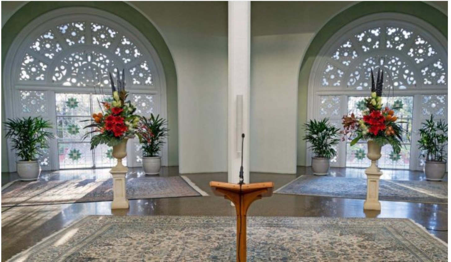
IMAGE: BAHAI HOUSE OF WORSHIP IN SYDNEY SHOWING TWO ENTRANCES

The Baha'i House of Worship, built above Sydney's northern beaches in 1961, is one of only seven in the world. Like all Baha'i temples it has nine sides and nine entrances symbolically representing unity.