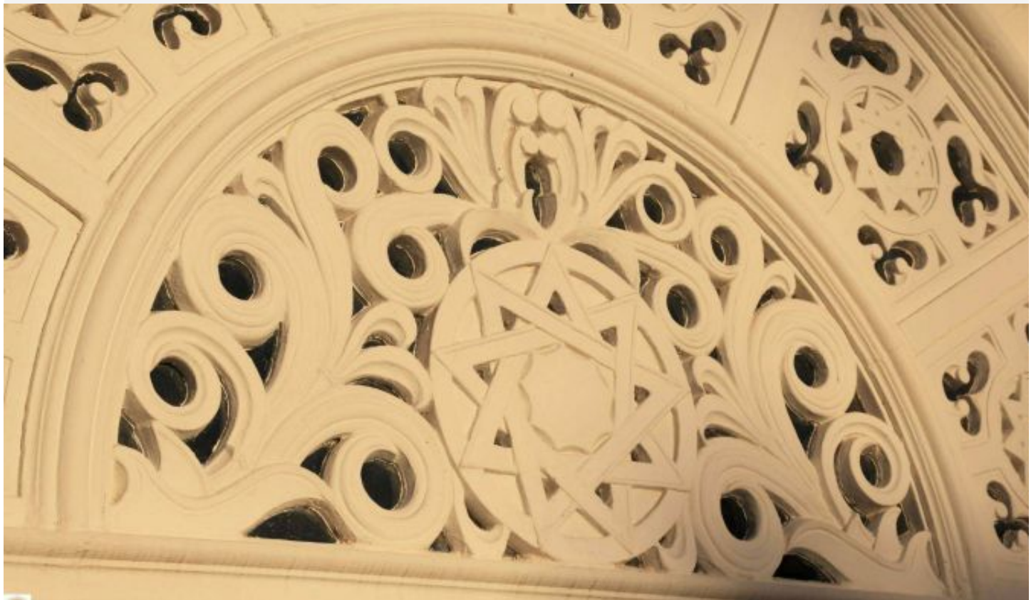
IMAGE: BAHAI HOUSE OF WORSHIP IN SYDNEY, SCULPTED SYMBOL

The words of the prophet-founder Baha'u'llah are used in many Baha'i songs, usually sung in three main languages of English, Arabic and Far